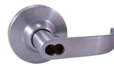
IC Curved Lever Stocked in US26D