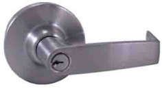
Flat Lever Stocked in US26D