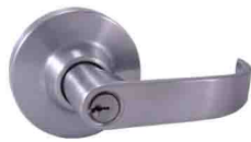
Curved Lever Stocked in US26D