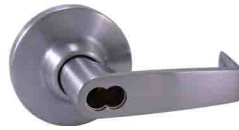
IC Flat Lever Stocked in US26D