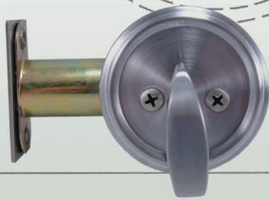
2" ADA Approved Thumb Turn with 3/32" Steel Mounting Plate