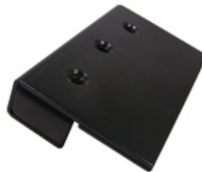
FBC-MB2 x BLK