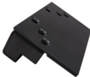
FBC-MB1 x BLK