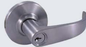
Curved Lever Stocked in US26D