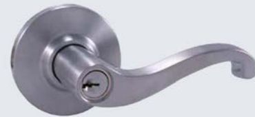
S-B Lever Special Order