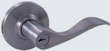
S-A Lever Special Order