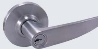
Half Curved Lever Stocked in US26D