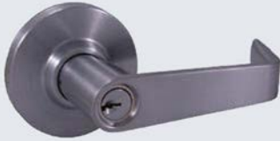
Flat Lever Stocked in US26D & US10B