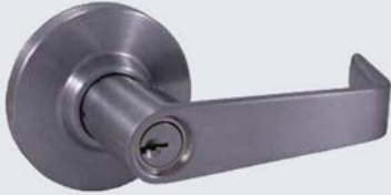
Flat Lever Stocked in US26D & US108