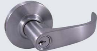
Curved Lever Stocked in US26D