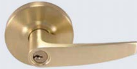
Half Curved Lever Stocked in US26D