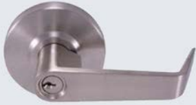
Flat Lever Stocked in US26D