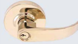
Curved Lever Stocked in US26D