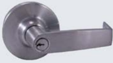
Flat Lever Stocked in US26D