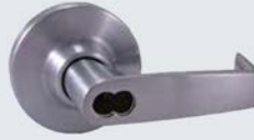
SFIC Flat Lever Stocked in US26D