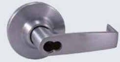
SLFIC Flat Lever Stocked in US26D