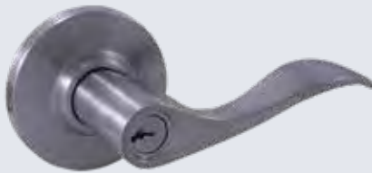
S-A Lever Special Order