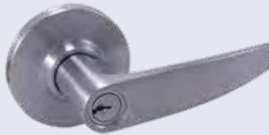
Half Curved Lever Stocked in US26D