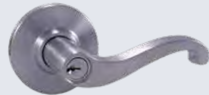
S-B Lever Special Order