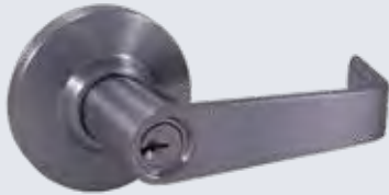
Flat Lever Stocked in US26D & US108