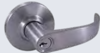
Curved Lever Stocked in US26D