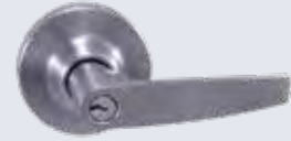
Half Curve Lever Stocked in US26D