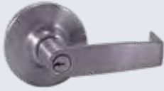
Flat Lever Stocked in US26D