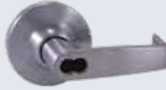
SFIC Flat Lever Stocked in US26D