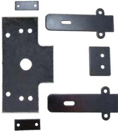
2000V/F2000V Shim Kit